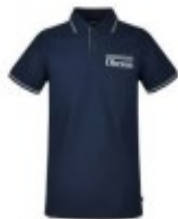
Short Sleeve Polo