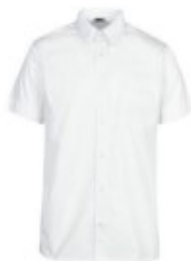
White Shirt - short sleeve