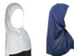
Hijab - Navy or White