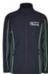
Shell Jacket - Oberon Logo