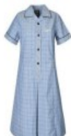
Blue School Dress