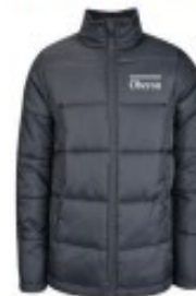
Puffer Jacket Embroidered with Oberon Logo