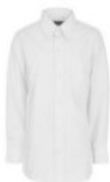
White Shirt - long sleeve